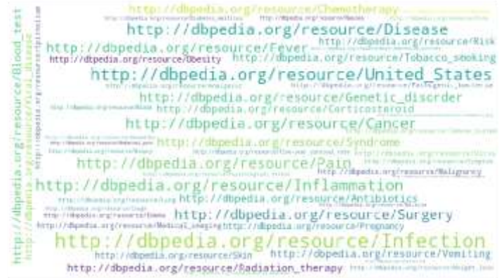
Fig. 3: WordCloud for NLP word token and DBpedia semantic terms inside the triple dataset.