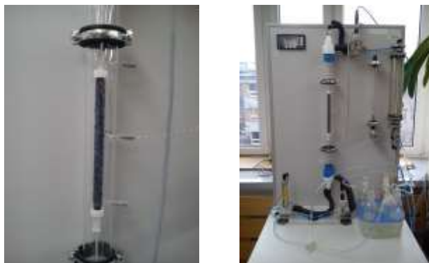
Fig. 1. An experimental setup.