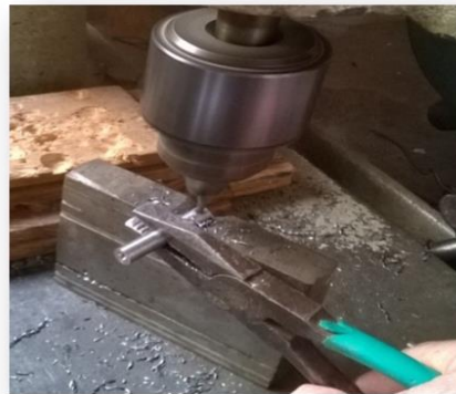
Figure1: Preparing of the sample for the weight loss measurements

The samples were polished with P200-P1200 polishing paper and labelled by creating a pair for each concentration of the extract.