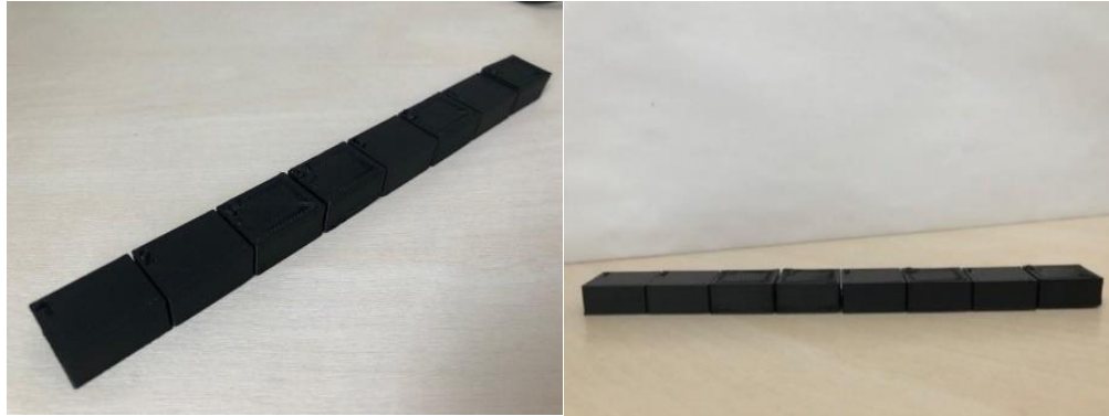
Figure 2: Printed parts

The measurements of width, length and height were made using a digital caliper, each measurement was repeated three times. Analyzing the results, it was defined which combination of printing factors obtains the best dimensional accuracy. Take a look at Figure 2, printed parts.