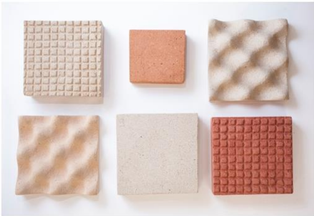
Fig. 5: Small material samples and test pieces, sizes 5 x 5 cm and 10 x 10 cm.