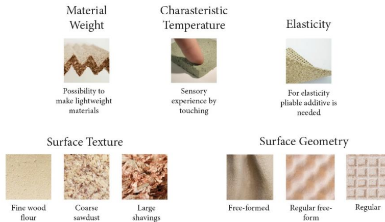
Fig. 3: Material samples of tactile experiments of the cast material.

Surface geometry. Three-dimensional shapes can invite touching of the material. This experience can be designed in advance by designing fascinating shapes. The moulding technique enables the making of the three-dimensional shapes, repeatable forms or extremely smooth designed surfaces, manufactured at one time. In this study, the surface geometry has been studied by making regular pattern-like forms, regular free-formed shapes and complete free-form surfaces. Shaping was successful and easy to implement using the selected technique.