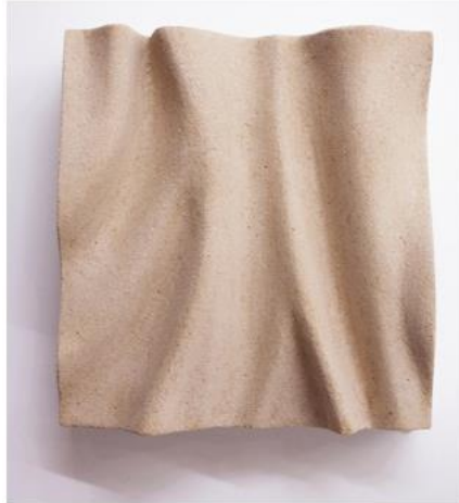
Fig. 4: Designed exhibition piece, large sample 20 x 20 cm.