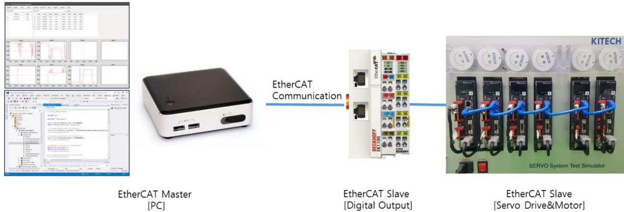
Fig. 2: Schematic diagram of experiment system.

Figure 2 shows the schematic diagram of the test environment set up for performance evaluation. A PC was used as EtherCAT master. For the EtherCAT slave, the Beckhoff EL2008 digital output device and 6 RSAutomation CSD7 sub-drives were used.