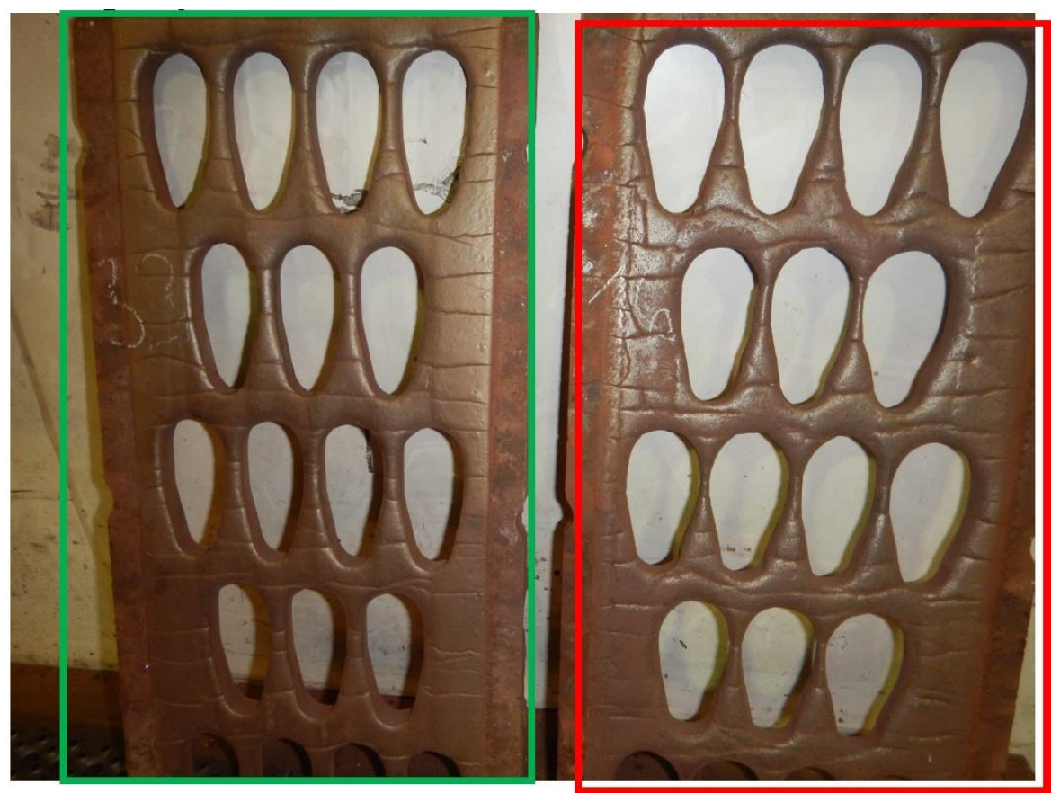
Fig. 4: Comparison: Advanced Plates (left/green/30weeks) <-> Standard Plates (right/red/weeks).