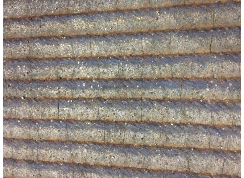
Fig. 2: Hardfaced Plate with Chrome-Carbide-Matrix.

It is vital for the hardfaced plates to have a very smooth hardfacing, especially the overlap of the welding beads, as these are potential predetermined breaking points[2]. In addition, it is mandatory to focus on controlled stress relief cracks to avoid an early fringing of the screening holes. An example of correspondingly welded plates is shown under Fig.2.