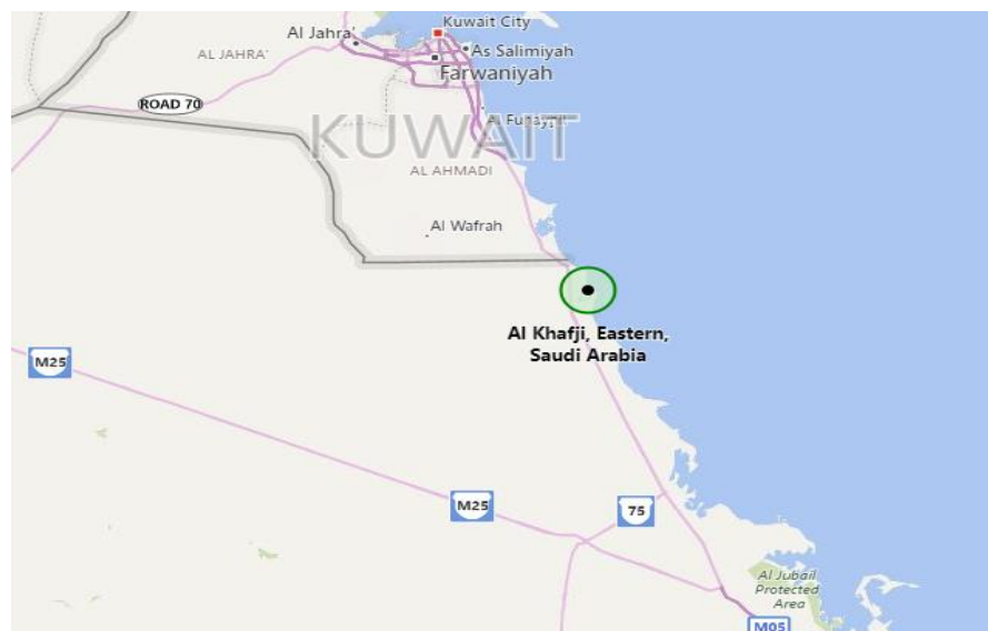
Fig. 1: The Persian Gulf study area (green circle).

Ras Al Khafji or Al Khafji (Fig 1) is an important area for oil extraction that has been shared between Kuwait and Saudi Arabia. In fact, it is a considered as neutral zone; due to this peculiar characteristic in recent history it has been one of the main reason for the Persian Gulf War in the beginning of the 90', the Battle of Khafji. It is on the border between Saudi Arabia and Kuwait in the Persian Gulf, precisely its coordinates are 28° 25' N and 48° 30' E.